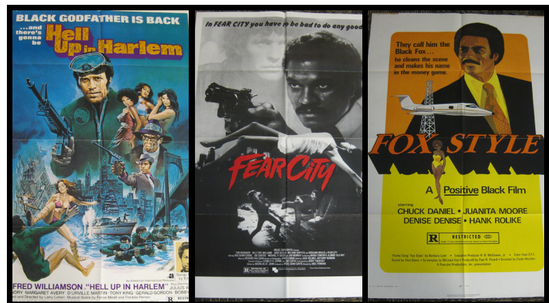
A selection of posters from the Percival Ethridge Collection.

Blog: blackfilmcenterarchive.wordpress.com/