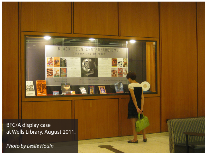
BFC/A display case at Wells Library, August 2011.